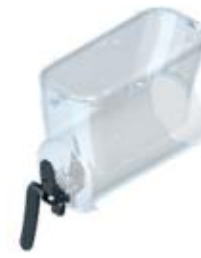
P&P Self-service 12L frozen drinks / 15L cold drinks COOL / CLASSIC / SMART