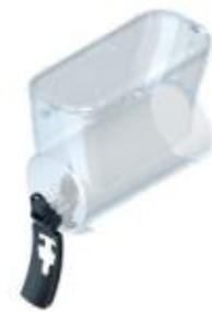
P&P Touchless 12L frozen drinks / 15L cold drinks COOL / CLASSIC / SMART