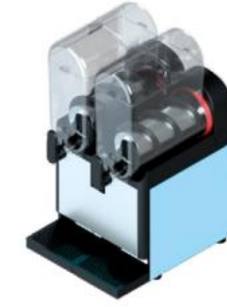
LATERALS With personalized design COOL / CLASSIC / SMART / DREAM