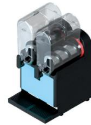
FRONTAL With personalized design COOL / CLASSIC / SMART / DREAM