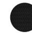
Black Laser Z2