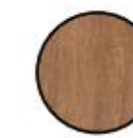
Dark Oak F5