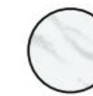
Mat white Marble NE31