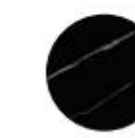
Ash black Marble U50