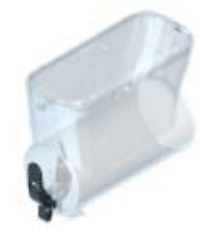
P&P 12L frozen drinks / 15L cold drinks COOL / CLASSIC / SMART