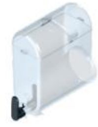
SMART 15L frozen drinks / 18L cold drinks COOL / SMART