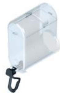
SMART Touchless 12L frozen drinks / 15L cold drinks COOL / SMART