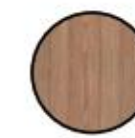
Golden Ebony CT35