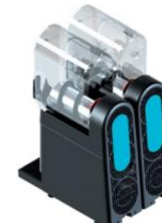
REAR With personalized design COOL / CLASSIC / SMART