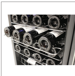
Shelves with Bottles