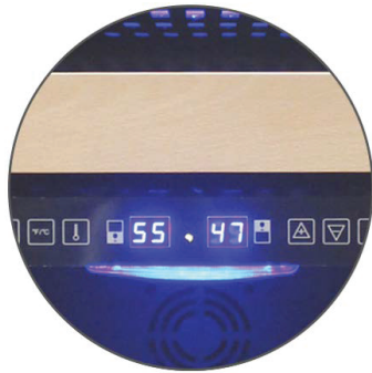
Temperature Control Panel