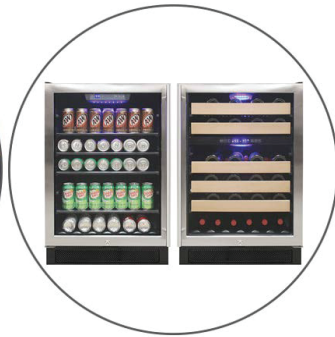
Shown paired with EL-46WCBC-L