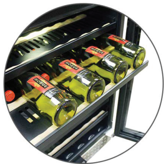
Shelves extend 30%