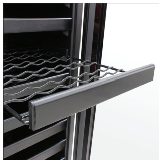
Empty Wine Shelves