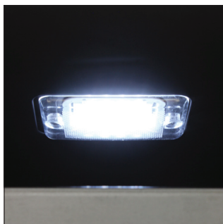
Top Interior Light