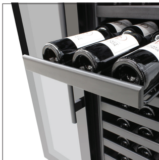
Bottles on Wine Shelves