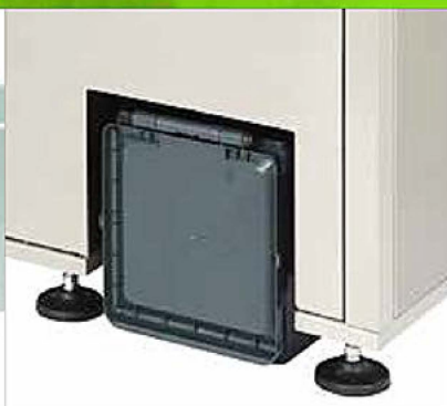
Bin location within the footprint