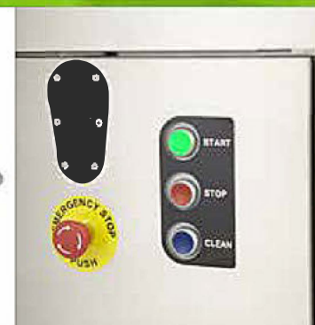
Visual control panel