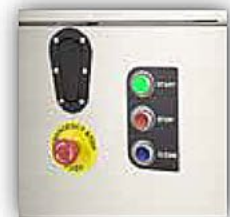
Visual control panel