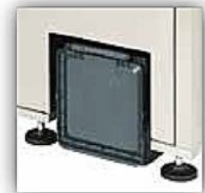
Bin location within the footprint

Higher capture rate - High capture rates improve the quality of the "grey water" going to drain (less suspended solid particles), aiding local water authority approval.