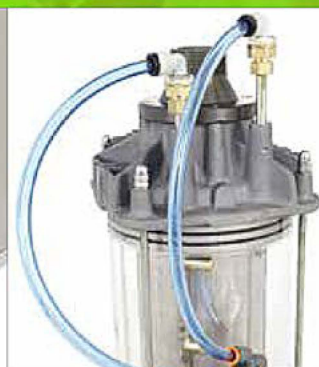
Self cleaning operation