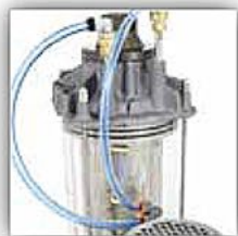
Self cleaning operation