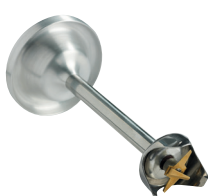
Emulsifying knife - 4 blades Ref. : AC530