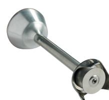
Beater disk Ref. : AC522