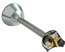
Emulsifying knife - 4 blades Ref. : AC520