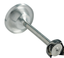
Beater disk Ref. : AC532