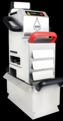
VITO® 50 up to 20 Litres