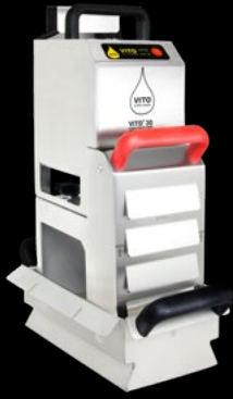
VITO® 30 up to 12 Litres

Choose the correct model for your fryer capacity