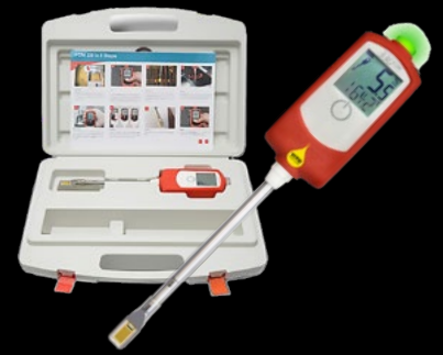
VITO FOM330 OIL TESTER