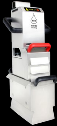
VITO® 80 over 20 Litres